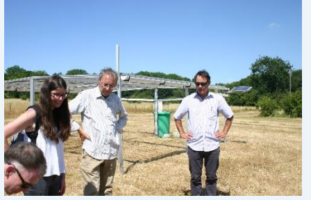
Update from the RainDrop Team at Wytham

ECT needs you to help us 'champion' LTEs for all! Please do consider giving to the charity this year via our new <u>online</u> <u>giving platform</u>. Thank you!